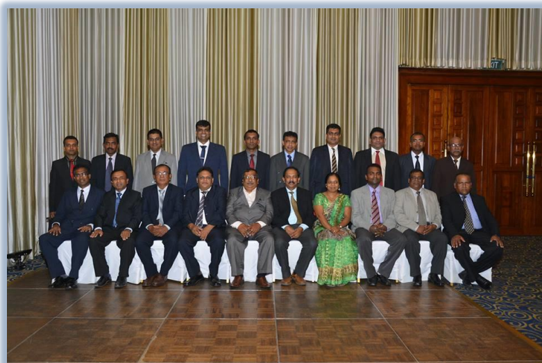
The First batch of Chartered Geologists of Sri Lanka.

Up to now, IGSL has granted the Chartered Geologist (CGeol.) award to 25 members to cater to the demand for professionally qualified geologists in the country.