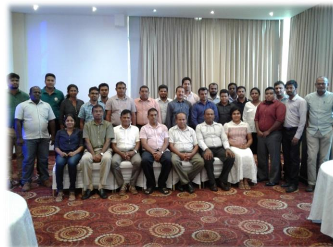
Participants of the 3 rd CPD Programme