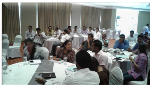
Participants representing geology related state and private organizations completed this training

IGSL would like to thank the pool of Resource Persons and Educational Committee of IGSL for their exertion to conducting these workshops and participants representing geology related state and private organizations for success of the programmes.