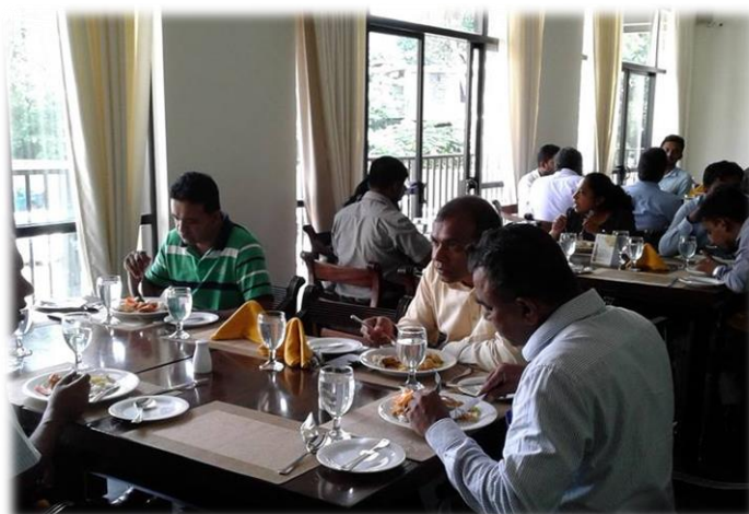
During lunch at the 2 nd CPD Programme